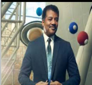
Neil DeGrasse Tyson, Astrophysicist, Author

“When different experiments give you the same results, it is no longer subject to your opinion. That’s the good thing about science. It’s true whether or not you believe in it. That’s why it works.”